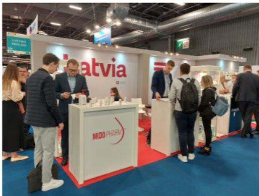
Proposal for EU Pavilion

Exhibitors' Package ensures a smooth operation -at a fixed cost and sustainability. This is Scandinavian Quality: