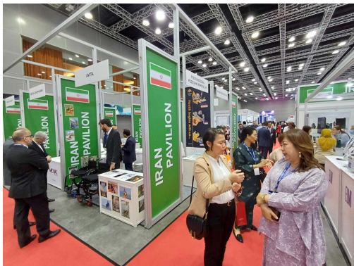
Proposal for Iranian Pavilion